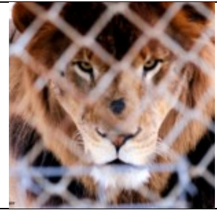
The scare on his nose is from being locked up in a tiny cage while in the circus