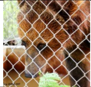
Getting a drink