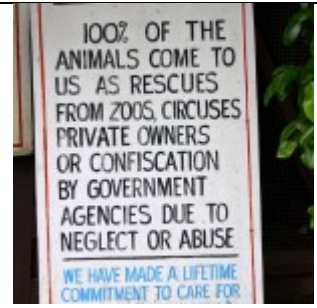
100% are rescued