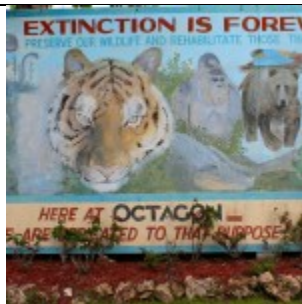
Extinction is Forever