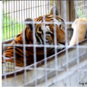
In the pool