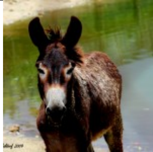
Hanging out by the pond