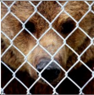
What are you looking at?