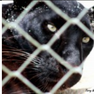
Lilly close up